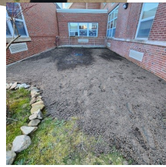
Loam & grass for new Reading Garden