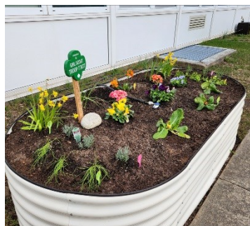
Harwich Girl Scouts planted in the raised bed donated by GCH