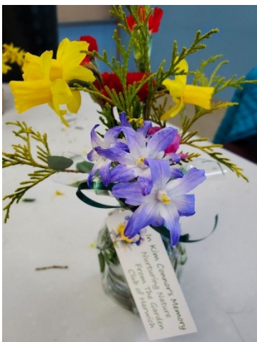
Beautiful April Bulbs enhanced all of our bouquets.