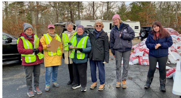
Helpful Club Members