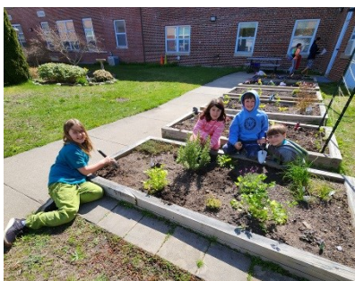
Weeding the Herb Garden