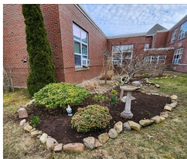
Gnome Bed Before and Gnome Bed After