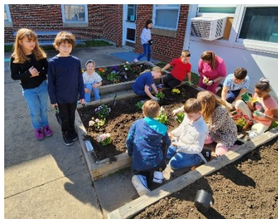
Tuesday Garden Club