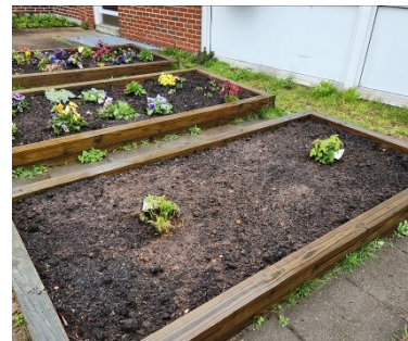
Thornless raspberry & blackberry bushes