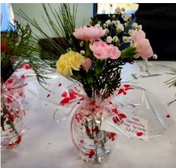
Lots of Love!