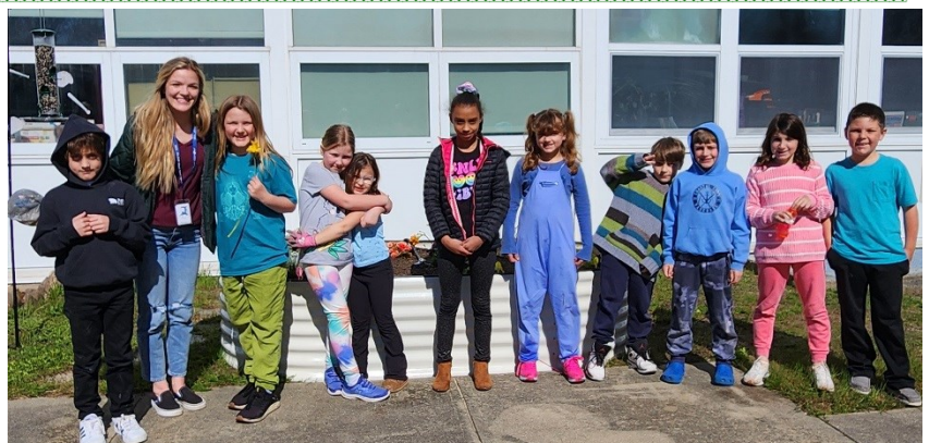
Harwich Elementary School Tuesday Garden Club