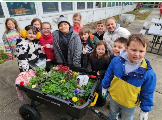
Harwich Elementary School Monday Garden Club