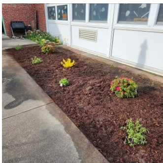
New azaleas, salvia & forsythia