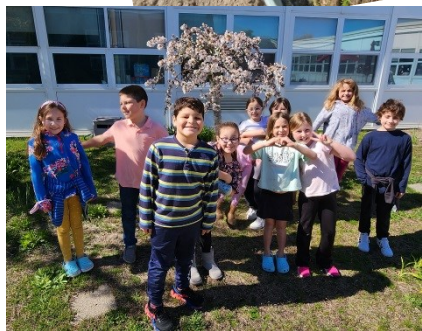
Group photo in front of cherry tree