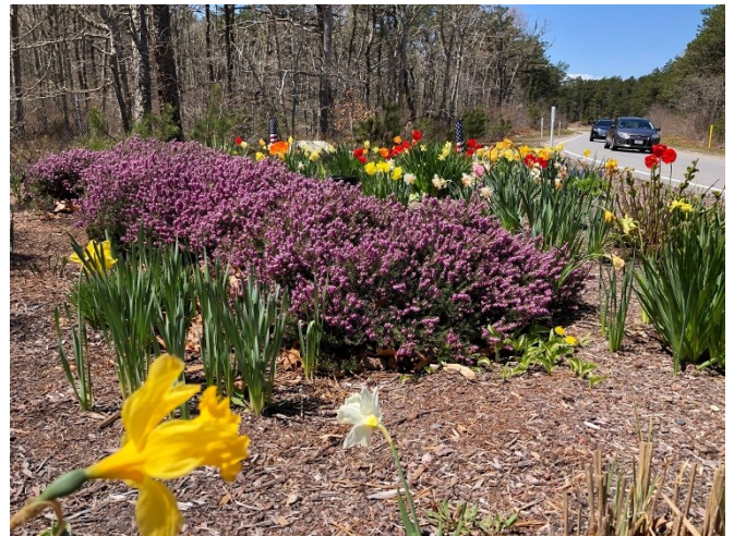
Exit 82 (10) in beautiful bloom.