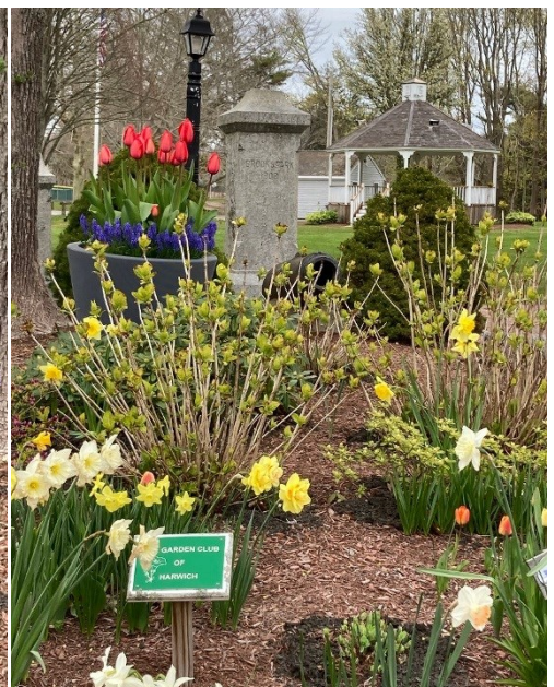
Brooks Park Entrance ~ Shouting Spring is Here!